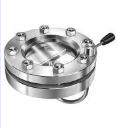
Wiper system WS, built into a VETROLUX® sight-glass to DIN 28120, DN 100, PN 10.

Series WS with sideways operated flexible shaft driven wiper blade for circular sightglasses to DIN 28120 or similar