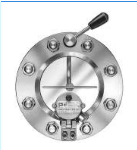
Wiper system WS, built into a VETROLUX® sight-glass to DIN 28120, DN 100, PN 10, with mounted sightglass light fitting miniLUX®, type KVL 50 HDSch, 24 V, 50 W, for combined "view and light through one assembly".

Wiper mechanism: Stainless steel for all parts in contact with the product Wiper blade: PTFE or silicone Sealings: PTFE (admitted for use in food processing industries)